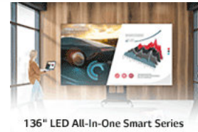
136" LED All-In-One Smart Series